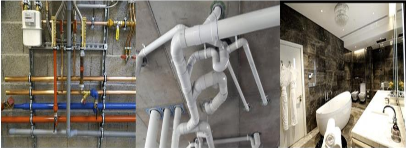
PHOTO : Plumbing and sanitary works