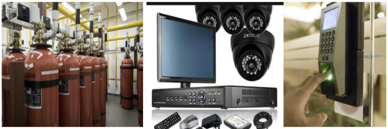
Photo : Fire-fighting, CCTV & Access Control Systems