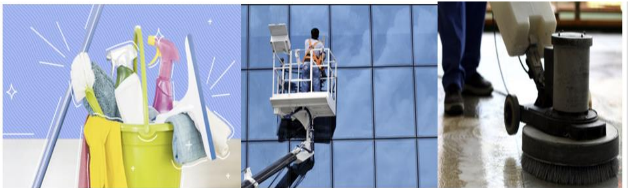
Photo : Professional cleaning Services.

We provide high-quality building cleaning services. Our cleaning team is well-trained and equipped with modern cleaning equipment and devices.