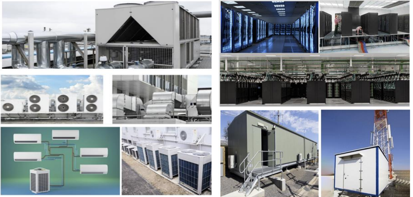
Photo: HVAC & cooling Systems for residential, commercial, Data Center & Telecom infrastructure